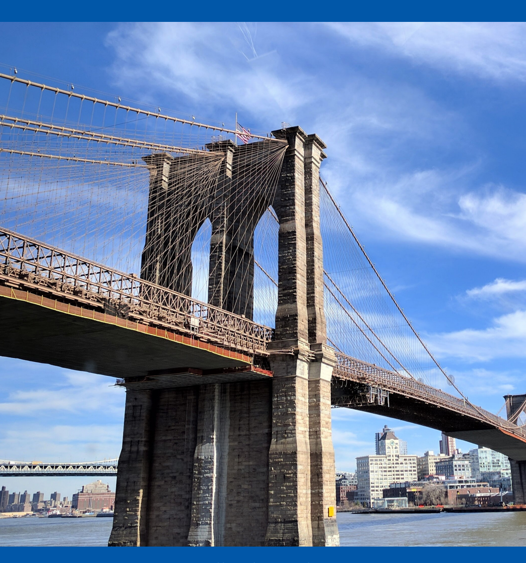
Brooklyn Bridge, New York, NY