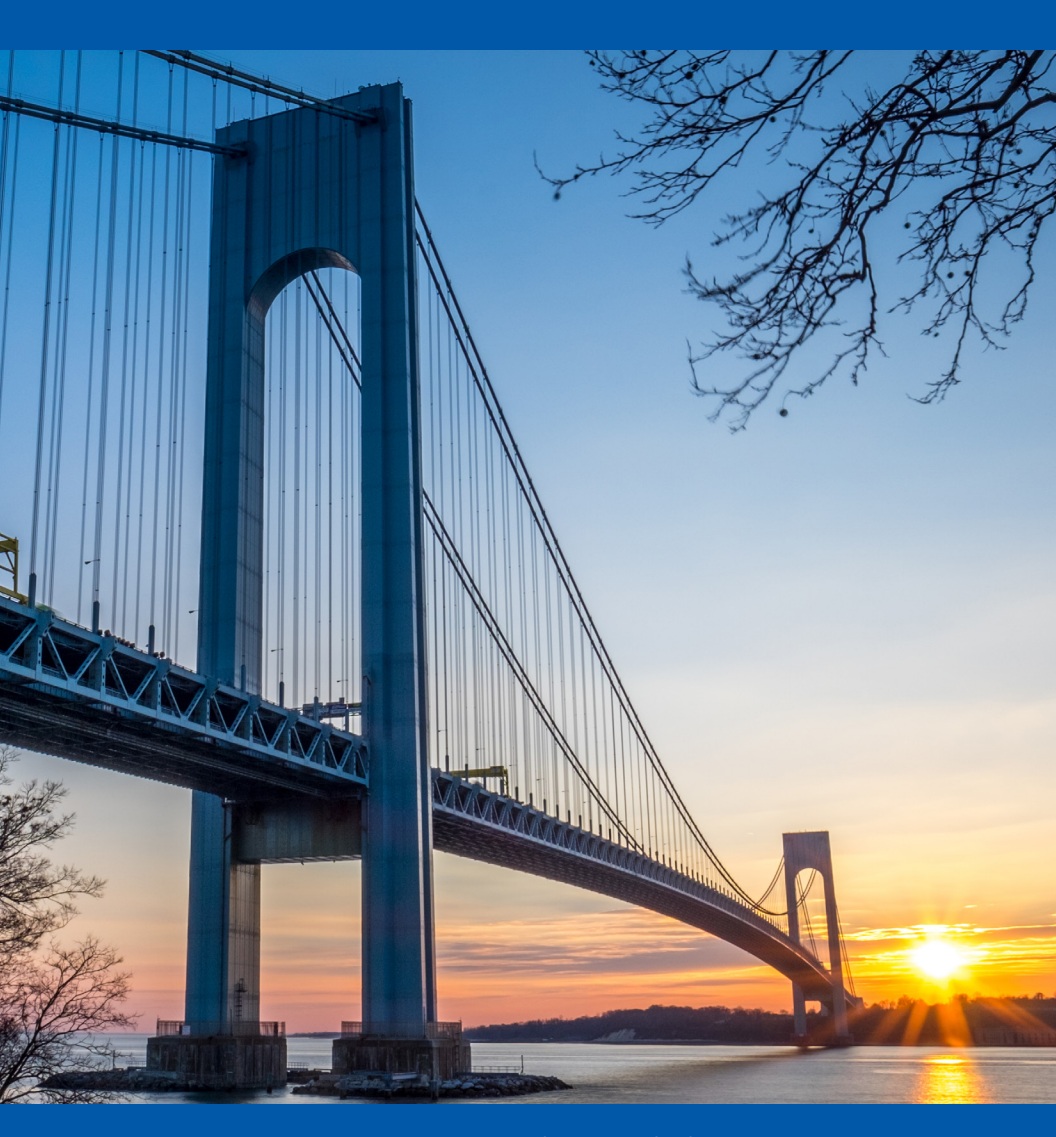
Verrazzano-Narrows Bridge, Staten Island, NY