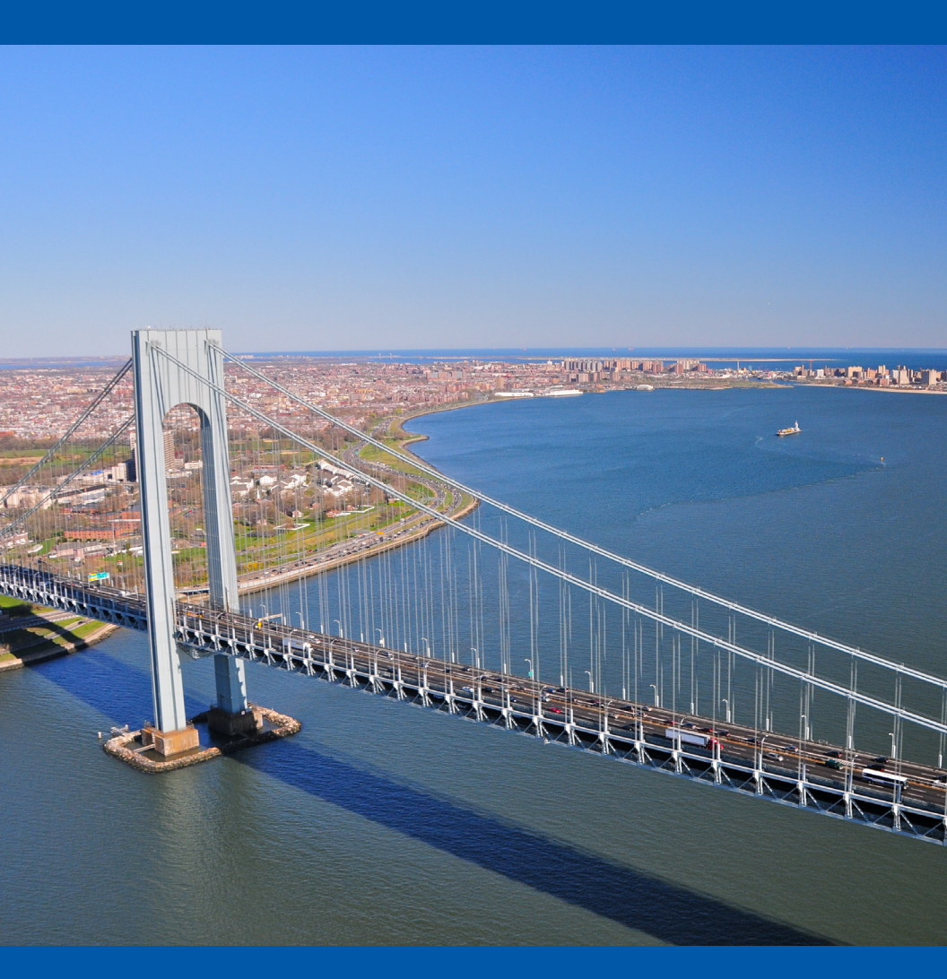
Verrazano-Narrows Bridge, Staten Island, NY