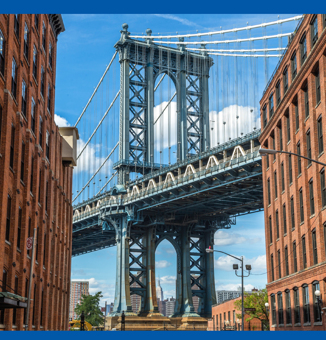
Manhattan Bridge, New York, NY